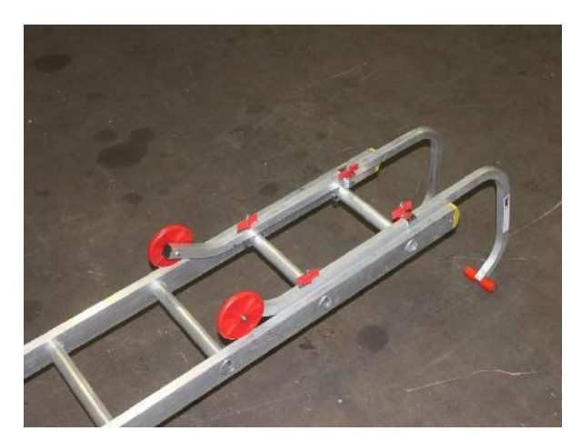
Fully assembled & ready to use