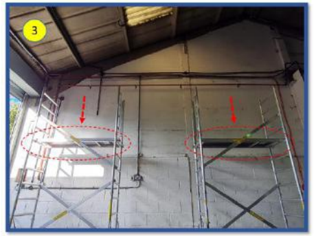
Complete tower assembly by adding diagonal braces, top platform...