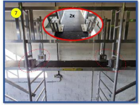
Insert infill decks between platforms.