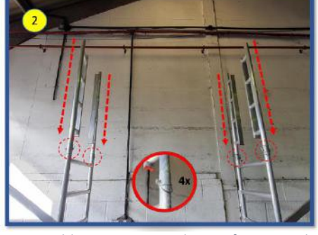
Assemble towers up to the top frames and insert walk through frames as shown. Secure with snap pins.