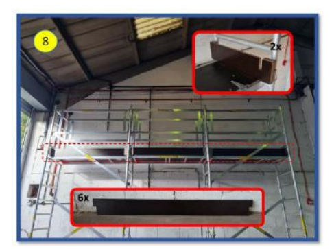
Insert toeboard as shown if required.