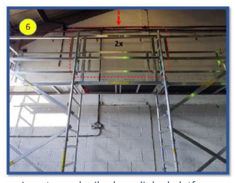
Insert guard rails above linked platform.