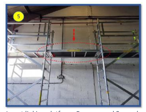
Insert linking platform. Recommend 2 people.