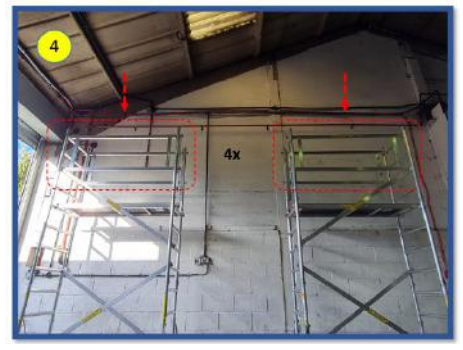
...and guard rails.